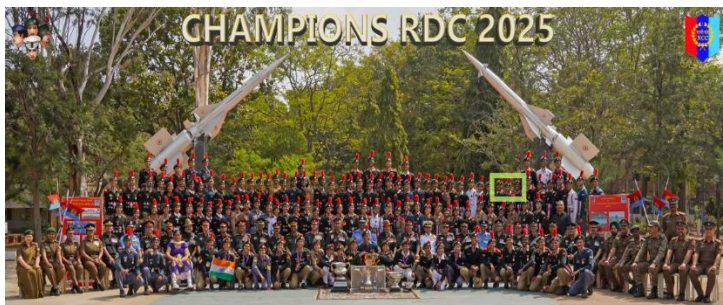
NCC DIRECTORATE KARNATAKA AND GOA HAS BEEN AWARDED THE PRESTIGIOUS PRIME MINISTER'S BANNER AND CHAMPIONS TROPHY 2025 AT THE REPUBLIC DAY PARADE CAMP, NEW DELHI.

Karnataka and Goa Directorate won the first place in the Overall Championship and secured the Prestigious PM Banner for 2024-25.